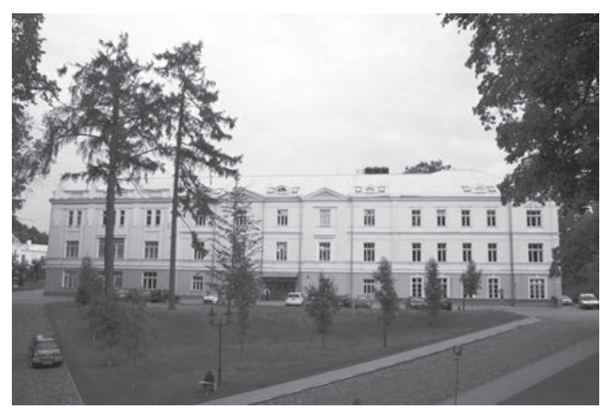
Fig. 1. The former hospital building on Toome Hill in Tartu. Having undergone renovation, it now houses the Faculty of Social Sciences of the University of Tartu. Photo: Ü. Valk, 2016.