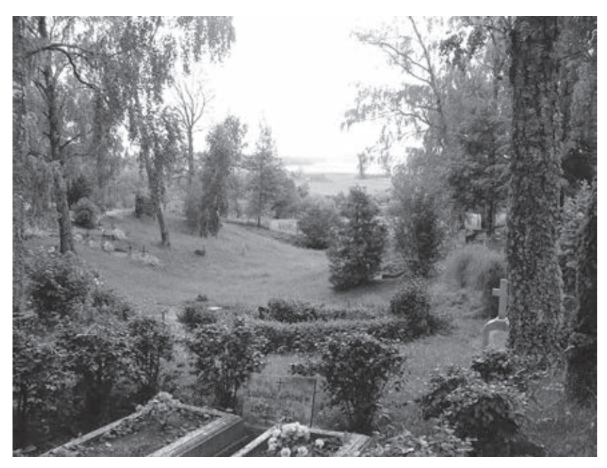
Fig. 4. Brieksīnes kalns ('Brieksīne hill') and cemetery in Baltinava parish – place of a sunken church. Photo: S. Laime, 2006.