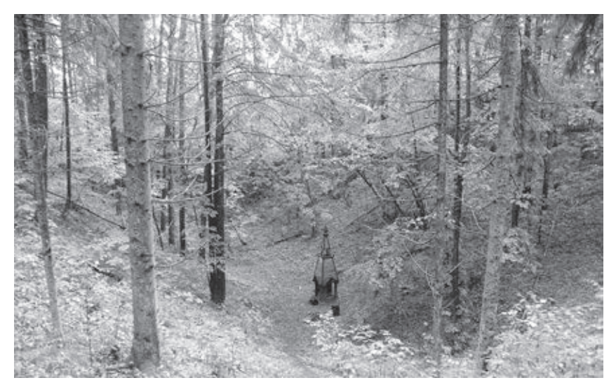
Fig. 5. Balkanu kalni ('Balkani hills') in Šķilbēni parish – place of a sunken church, nowadays a tourist spot.