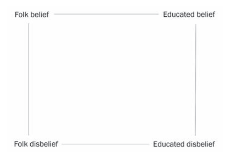
Fig. 1. The four possible combinations of the dyads folk/educated and belief/disbelief.

itself is a historical formation: a category that only came fully into being as a result of what Peter Burke (1978) calls the 'withdrawal' of the elites from popular culture, or what Max Weber terms 'disenchantment'. In this period, the newly-opened gap allowed the creation of a new subject of study – which was alternately as a site of thrills, disgust and delight.