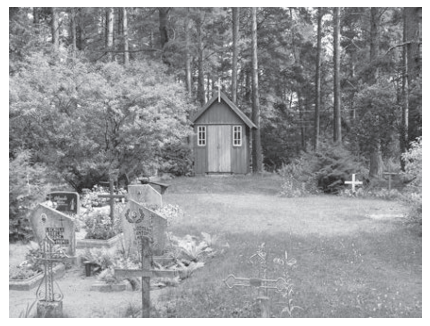
Fig. 1. Wooden chapel in Dziervīne cemetery, Baltinava parish.