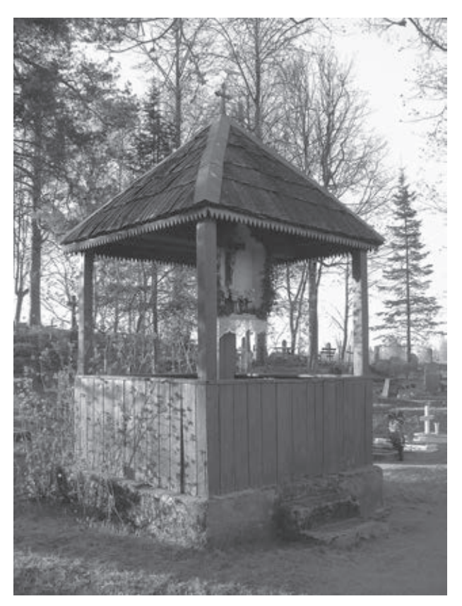
Fig. 2. Crucifix in Viduči cemetery, Medņeva parish.